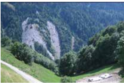
150 PE in Switzerland