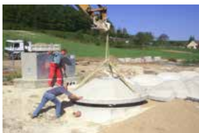
300 PE in France