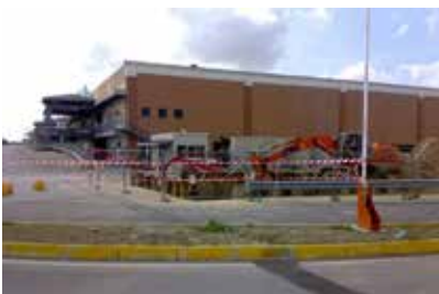
250 PE in Italy