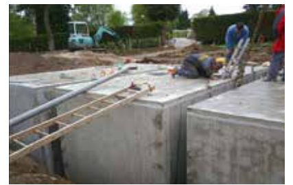
187 PE in France