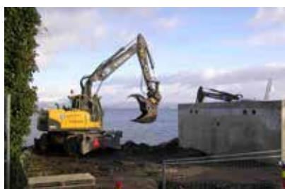
1.000 PE in Norway