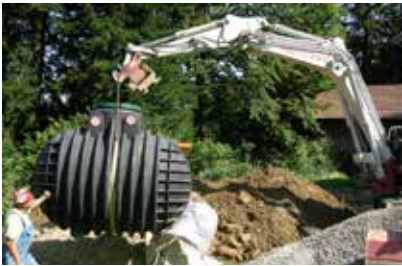
4 PE in Germany