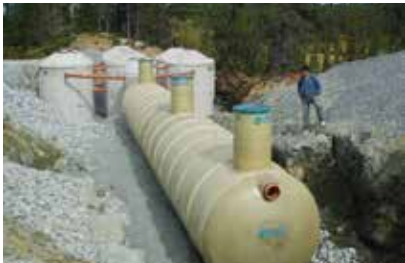
350 PE in Norway