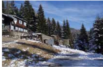
51 PE in Germany