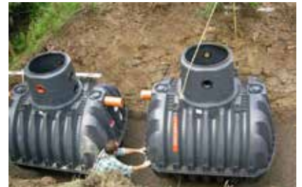
12 PE in Germany