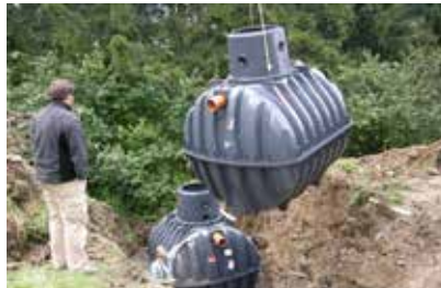
12 PE in Germany