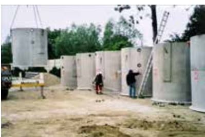
300 PE in France