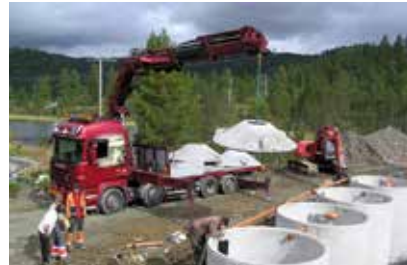
125 PE in Norway