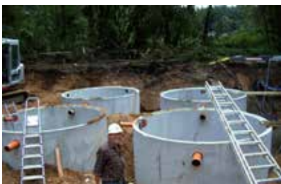
600 PE in Germany