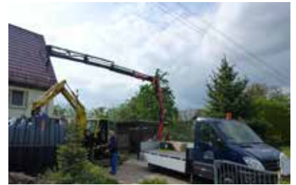
8 PE in Germany