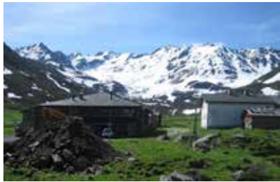
40 PE in Switzerland