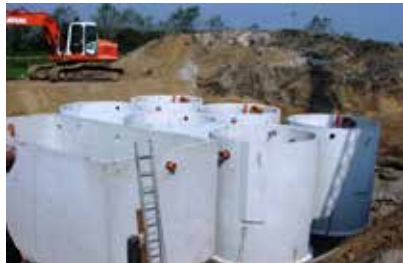
400 PE in Germany