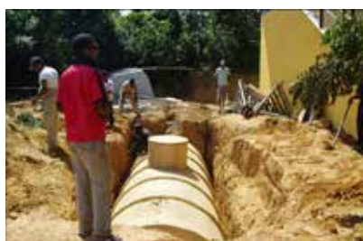
25 PE in Sri Lanka