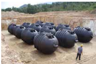
300 PE in Vietnam