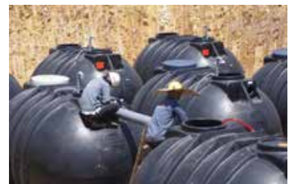
300 PE in Vietnam