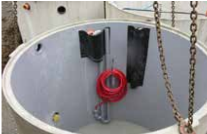
100 PE in Germany