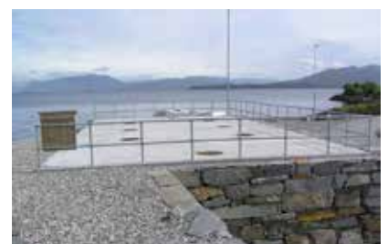
1.000 PE in Norway