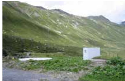
40 PE in Switzerland