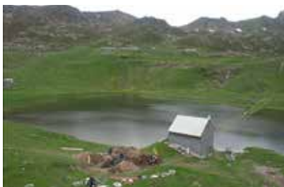
15 PE in Switzerland