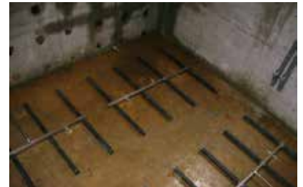
500 PE in Bulgaria