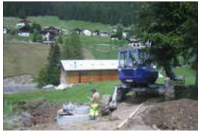
4 PE in Switzerland