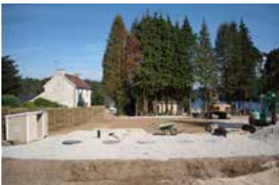
187 PE in France