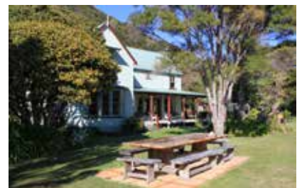
20 PE in New Zealand