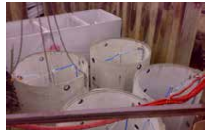
250 PE in Italy