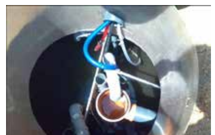
25 PE in Sri Lanka