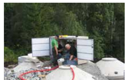
300 PE in Norway