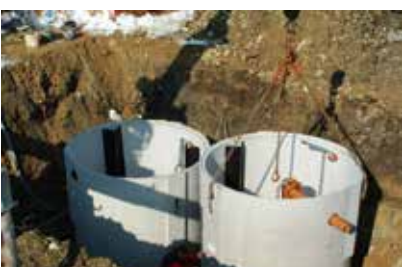
25 PE in Germany