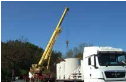
40 PE in Germany