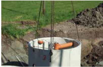
40 PE in Germany