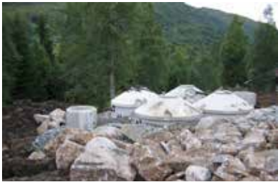
300 PE in Norway