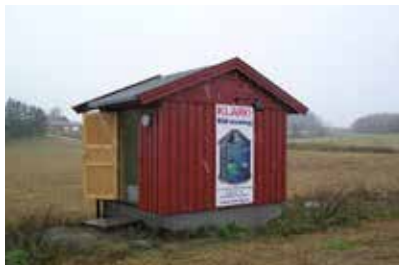
200 PE in Norway