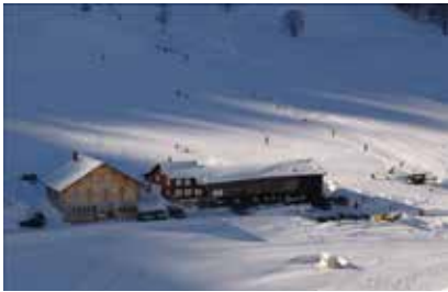
30 PE in Switzerland