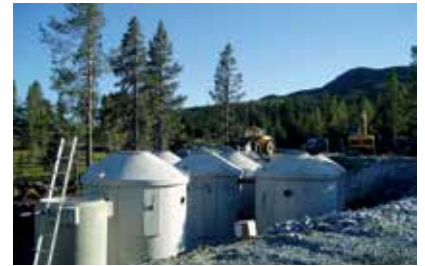
350 PE in Norway