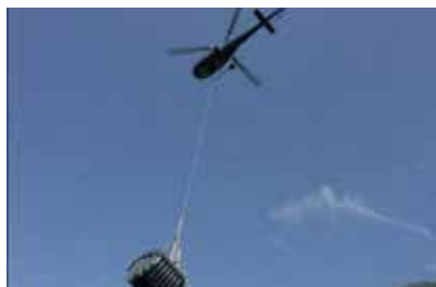
15 PE in Switzerland