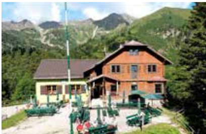
75 PE in Austria