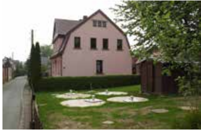
100 PE in Germany