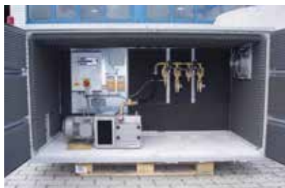
600 PE in Germany