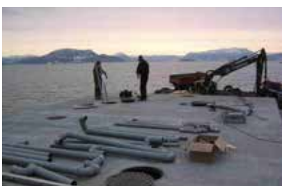
1.000 PE in Norway