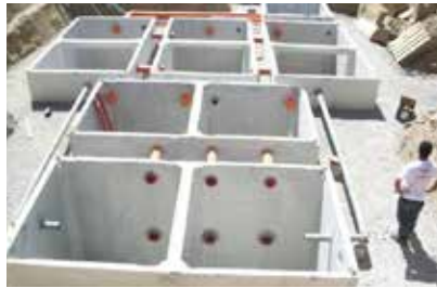
300 PE in Italy