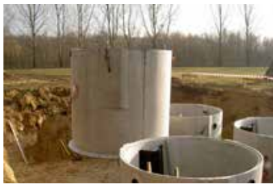
150 PE in Poland