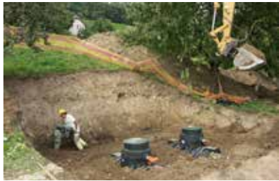
80 PE in Switzerland