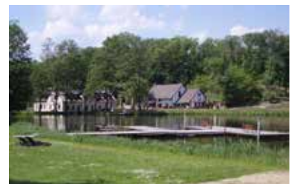
600 PE in Germany