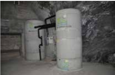
8 PE in Italy