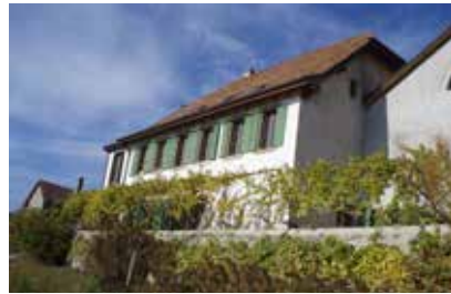
80 PE in Switzerland